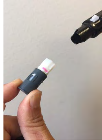
Throw used drum away into sharps box