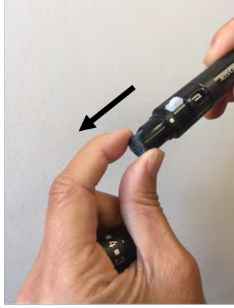
Pull out lancet drum