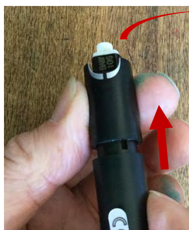
14. Use body of lancet device to push lancet off into sharps box. Replace cap