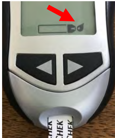
9. Wait to see a blinking drop of blood on screen