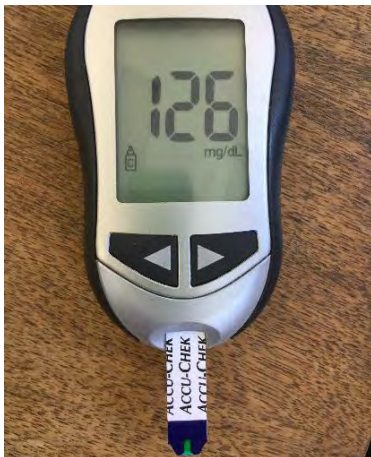
11. Read your blood sugar result