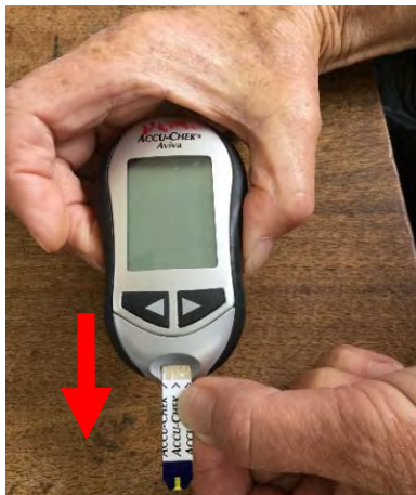
12. Pull test strip out to turn off meter