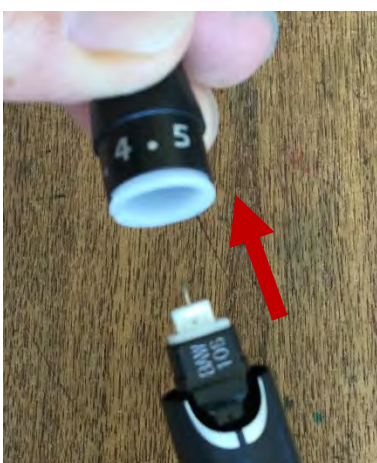
13. Remove cap