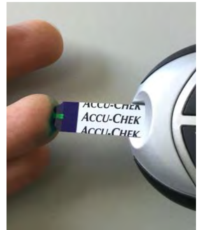
10. Apply drop of blood to yellow window on end of test strip